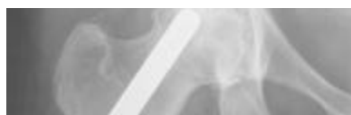
Figure 2. Porous tantalum implant in a Steinberg stage IV osteonecrotic hip, 2 years post-operatively.