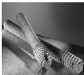
Figure 1. Trabecular Metal Osteonecrosis Intervention Implant System; tantalum implant used in all patients of this study.

non-weight-bearing for 3 weeks, to partial weight-bear for the next 3 weeks, and to weight bear as tolerated thereafter.