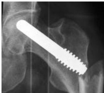
Figure 3. Periprosthetic fracture occurring 4 weeks post-porous tantalum implant insertion after a fall from her own height.

the 14 Harris hip scores used for analysis was 23.2 months (range 12 to 48). This excludes three patients, one of which had bilateral involvement, in whom one operated hip failed prior to the 12-month mark, more precisely at 7, 8 and 10 months post-tantalum insertion, as well as one patient who sustained mild trauma to her single operated hip (fall from own height) resulting in a periprosthetic fracture (see Figure 3). This represents a failure rate of 22.2% at one year postoperatively. 6 additional hips in 4 patients, including all 3 patients with bilateral implant intervention including one whose contralateral hip had failed earlier, had undergone total hip arthroplasty before the final time of follow-up. Therefore, 10 out of 18 (55.6%) tantalum implant procedures failed within the study period. The mean time for failure, excluding the patient with a periprosthetic hip fracture, was 11.7 months (SD=3.7, range 7 to 20 months), and the mean age at surgery of the patients who failed was 50.1 years old (SD=12.1, range 29 to 66), compared to a mean age of 36.8 years old (SD=12.2, range 19 to 55) for the patients whose tantalum implant did not fail. Refer to Figure 4 for the Kaplan-Meier survivorship curve.