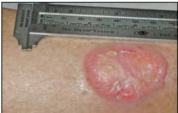
Figure 1: Gross view of a xanthomatous dermatofibroma found on this patient's left lower leg, measuring 4.5 x 3.2 cm in diameter.

also can demonstrate XIIIa positivity (6). Thus, histologic examination must be used to further distinguish XDF from AFX. The benign nature of XDF is apparent histologically, as the variant is characterized by well differentiated cells with little pleomorphism and mitotic activity, in contrast to the high degree of mitotic activity and atypical mitosis observed in AFX (3,7). From a clinical standpoint, the ability to distinguish xanthomatous dermatofibroma is very important, as an incorrect interpretation could result in inappropriate treatment.