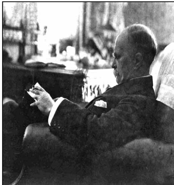
Figure 1: Sir William Osler, 1849-1919