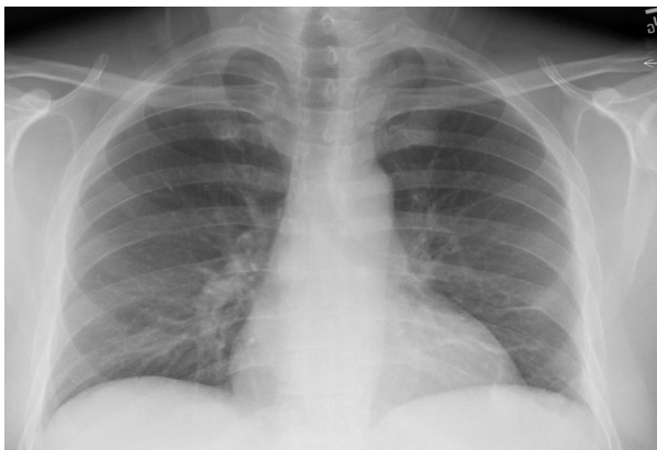
Figure 3: Chest x-ray follow-up in three months.

a trial of octreotide infusion, based on a limited number of previous case reports indicating efficacy of octreotide. An abrupt decrease in pleural fluid drainage with complete resolution within 72 hours following octreotide infusion indicated a therapeutic response. In this context, TIPS procedure has been shown to decrease the portal vein pressure and thereby reduce ascites and pleural effusion. 5 Therefore; it is possible that octreotide therapy by reducing the portal pressure may have provided the same benefit as TIPS leading to the resolution of ascites and hepatic hydrothorax in this patient. As the clinical evidence for octreotide in the treatment of hepatic hydrothorax mounts, a multicenter controlled trial of octreotide is warranted.